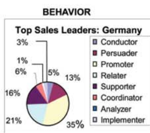
Study 2: Top Sales Leaders, Germany N=492