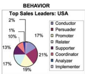
Study 1: Top Sales Leaders, USA N=178

For more information, please call Price Associates at 866-442-0556 or email us at info@price-associates.com .